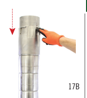
Make sure bolts on discharge are aligned with bolts in INTERCONNECTOR