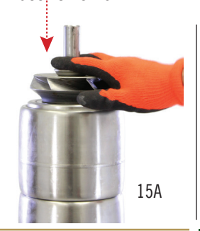
15 Place: TOP STAGE IMPELLER

Stages below a torqued IMPELLER should not rotate.